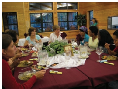
Ladies enjoying a meal that they did not have to cook.

Inspiring messages, laughter, tears, simply good fellowship and delicious food were highlights of the 2009 Annual Retreat for Pastors' Wives held at Camp Wakonda September 18-20.