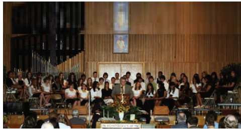
WA Choir 2009-2010

Prior to the play, Andrews University will have staff on campus helping students complete their FAFSA forms (application for aid). Parents may want to talk with the representatives also.