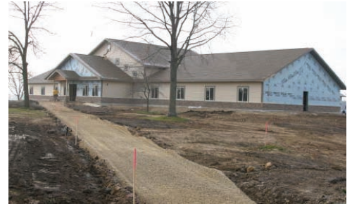
Girl's Dorm as of November 12, 2009

Excitement is building as every day shows new progress on the new Girl's Dormitory at WA. At present the siding is going on the exterior and the brick work has already been completed. Many sub-trades