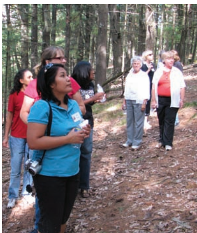
Enjoying God's nature