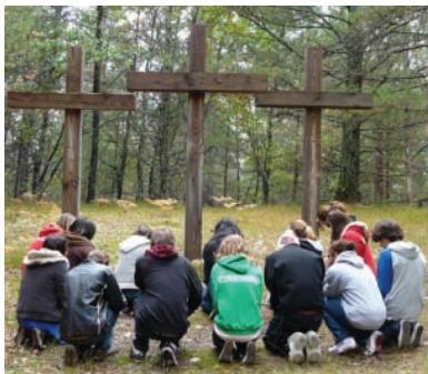
Understanding the gift