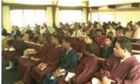
Some of the 30 people baptized in Milwaukee Northwest

reasonable to baptize approximately 10% of those attending on opening night. For my district that would be about 5.5 people who we should expect to baptize. That is far short of the 32 that my district has as their growth goal. Many hearts were heavy.